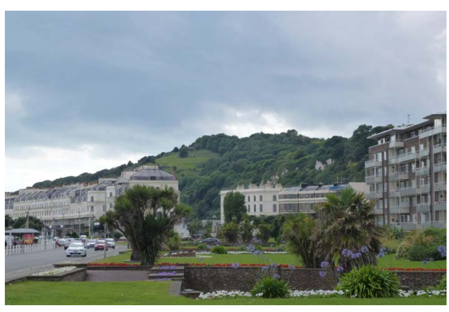
Marine Parade Gardens

Due to their layout, height and architectural form the historic buildings in the conservation area are imposing and visually dominating, even when viewed from some distance. Despite this, the buildings are not overwhelming or foreboding when within or adjacent to the conservation area and this is due in part to the wide roads and generous spaces both between and around the buildings within the conservation area and adjacent to the existing boundary. The open spaces of Marine Parade Gardens, Granville Gardens, the Esplanade and the beach, and the single storey, functional form of De Bradlei Wharf (although all currently outside the boundary of the conservation area) enhance the stature of the buildings and consequently make a positive contribution to the setting of the conservation area.