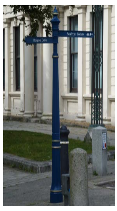
Traditional cast iron single sign post

While some of the works have been successful in creating an attractive public realm, others have led to clutter that distracts from the homogeneity of the area. The existing extensive signage and traffic calming features would benefit from a cohesive strategy to reduce clutter, improve the setting of the listed buildings and structures and to generate a friendlier atmosphere.