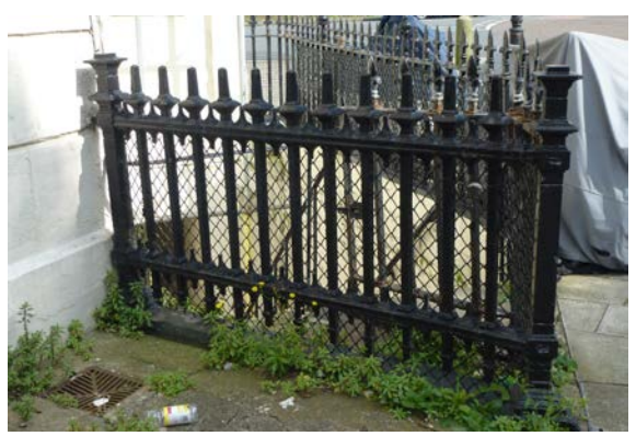
Remnant of railings to New Bridge House