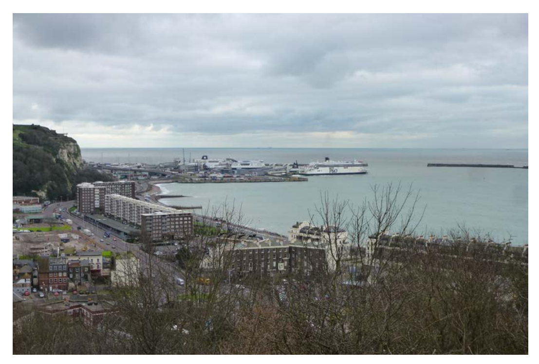
The view from Dover Western Heights

The Waterloo Crescent Conservation Area is situated to the southwest of Dover town centre, nestled between the A20 and the outer harbour of the Dover Western Docks, and encircled by Dover Castle and the Western Heights. Built upon what is effectively reclaimed land, composed of silt, shingle and sand deposited by the River Dour and longshore drift, the topography of the conservation area is completely flat.