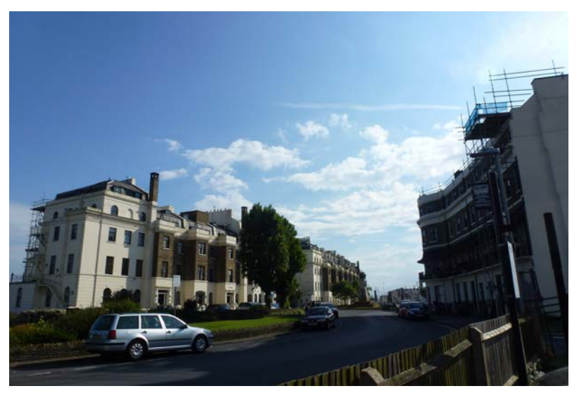
Looking towards the 60th Rifle Memorial and the rear of Waterloo Mansions

There are various features that have had a detrimental effect on the setting of the conservation area; the two car parks, one adjacent to Camden Crescent and one to the west of Waterloo Crescent, and modern development adjacent to the conservation area. The Gateway imposes on views out of the conservation area towards Dover Castle and looms dominantly in long distance views into the conservation area from both the Castle and Western Heights. However the open spaces adjacent to the conservation area enhance the stature of the buildings.