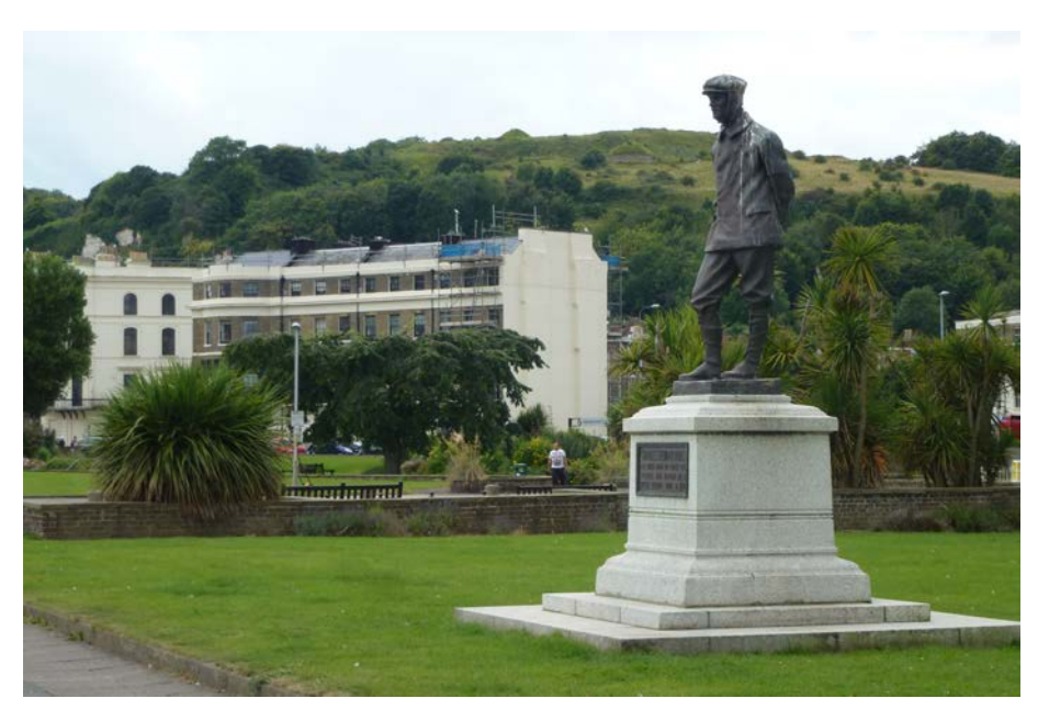
View towards Camden Crescent from Marine Parade Gardens

Due to their layout, height and architectural form the historic buildings in the conservation area are imposing and visually dominating, even when viewed from some distance. Despite this, the buildings are not overwhelming or foreboding when within or adjacent to the conservation area and this is due in part to the wide roads and generous spaces both between and around the buildings within the conservation area and adjacent to the existing boundary. The open spaces of Marine Parade Gardens, Granville Gardens, the Esplanade and the beach, and the single storey, functional form of De Bradlei Wharf (although all currently outside the boundary of the conservation area) enhance the stature of the buildings and consequently make a positive contribution to the setting of the conservation area.