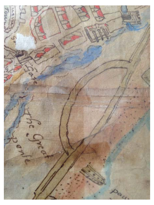
The Platt of Dover Castel Towne and Harbour by William Eldred, 1641

The Waterloo Crescent Conservation Area is on land which was created by accident during the first half of the Sixteenth Century. The formation of a new harbour at Archcliffe to the west of Dover caused an unbalance in natural coastal processes and created a spit of sand and shingle which blocked the route up the River Dour to the ancient Roman harbour. Called the 'New Spit', by 1566 this shingle bar extended as far as the foot of the cliffs on which Dover Castle sits, and now mark the present day shoreline. During the reign of Elizabeth I the shingle spit was consolidated and a tidal lagoon called the Great Pent developed between the original foreshore and the spit. Fed by the River Dour, the lagoon was developed to become Wellington and Granville Docks.