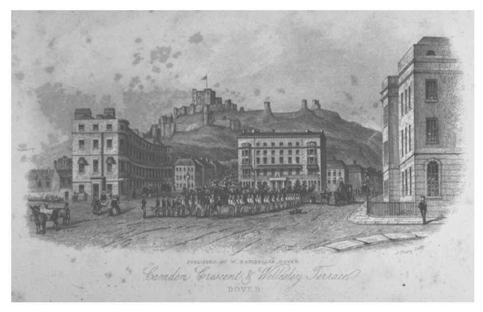
An engraving showing Camden Crescent to the left and side of Waterloo Crescent to the right; late Nineteenth Century

Historic maps from the Seventeenth and Eighteenth Centuries show a bridge (variously labelled Buggins, Brungars or Bengers Bridge) over the River Dour in the approximate location of New Bridge. In the early Nineteenth Century the brick built New Bridge was erected over the River Dour, which gave direct access from the town via Bench Street. Development of the area was now possible but it was not until 1835 when Cambridge Road was laid out to connect with the New Bridge that major building works started with the construction of Waterloo Mansions and Crescent as the beginnings of the new 'visitor quarter' of Dover.