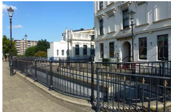
Well designed and detailed public realm works