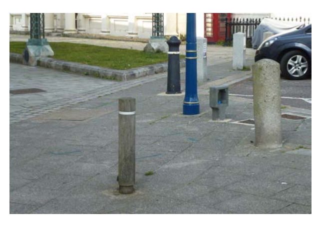
A variety of bollards

The open spaces within and around the Conservation Area contribute to its character by emphasising the scale of the buildings and providing an attractive place to be for visitors and residents.