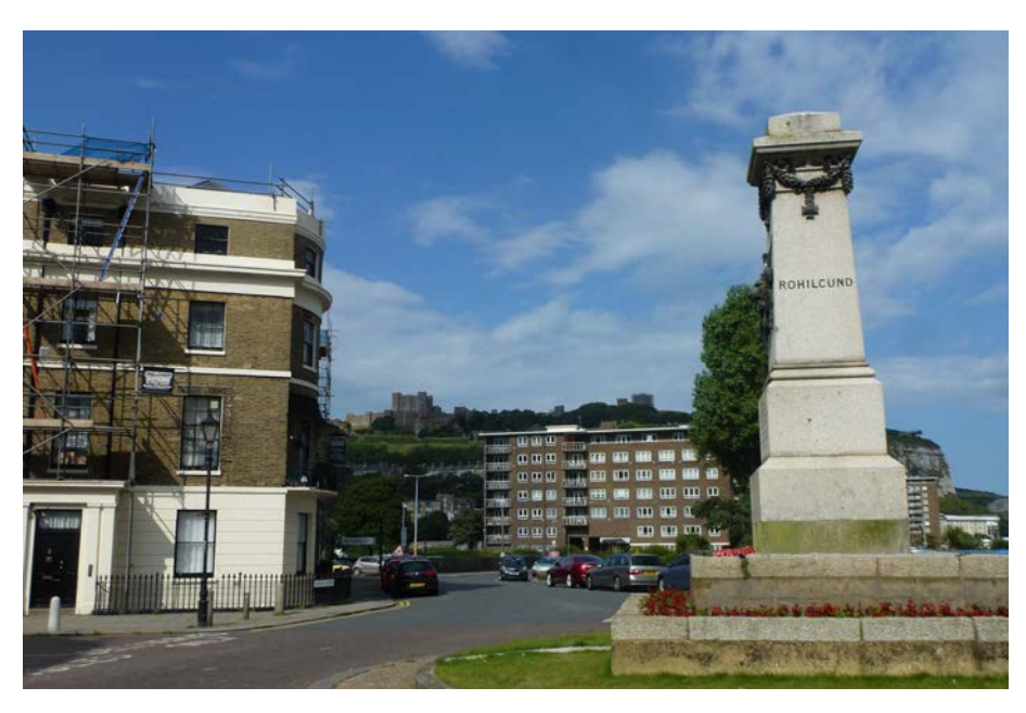
The 60th Rifles Memorial

The memorial occupies a prominent position, and is a significant focal point within the heart of the conservation area. Despite surrounding buildings being three or three and a half storeys high the memorial is not overwhelmed or dominated, although due to its location it acts as a roundabout which can impede access to and appreciation of the memorial.