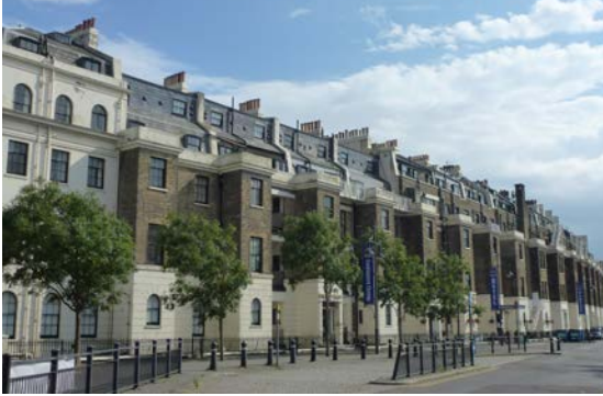
Waterloo Mansions - front elevation