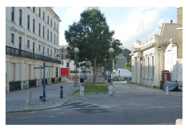
Looking towards Dover town centre with Cambridge Terrace to the left and New Bridge House to the right

While the underpass follows the original street pattern and provides a degree of connection between the town and Waterloo Crescent Conservation Area, the A20 forms a physical, noisy and visual barrier creating a disconnect between the town and the seafront. This has the impact of isolating the conservation area and views both into and out of the area are important to help set it in context within the town. Panoramic views of the conservation area can be gained from Dover Castle,