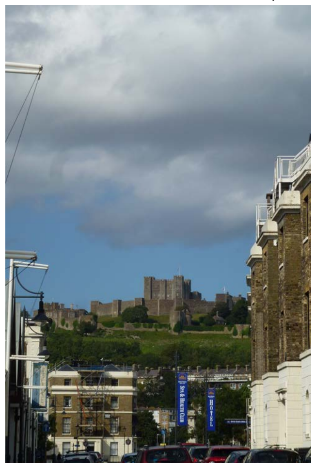
View from the Conservation Area to Dover Castle

The pivotal location within the conservation area is the war memorial. From this vantage point views are afforded of key features; Dover Castle, Dover Western Heights and the seafront. Any development proposals for sites within or adjacent to the conservation area should ensure that these views are protected or enhanced.