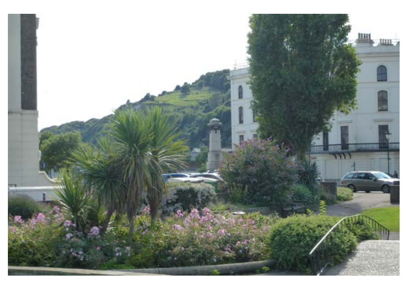
A view to Dover Western Heights from Granville Gardens

Any development that is proposed for sites within or adjacent to the conservation area would need to ensure that a key characteristic of the conservation area, the dominant and imposing nature of the historic buildings, is maintained or enhanced particularly when viewed from long distance vantage points.