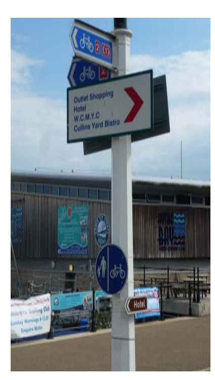
Historic lamp standard cluttered with signage