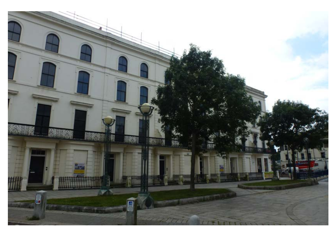
Cambridge Terrace - front elevation

With white render to the front elevation with yellow brickwork to the rear, Cambridge Terrace has a stronger vertical emphasis than Waterloo Mansions. Details are less ornate, excluding the exuberant iron balcony to the front elevation, with flat pilasters, quoin detail and a plain panelled plaster frieze below third floor level. The hierarchy of each floor level is retained with windows following the typical pattern, and the entrance doors with their overlights are surrounded by a robust Tuscan porch. The