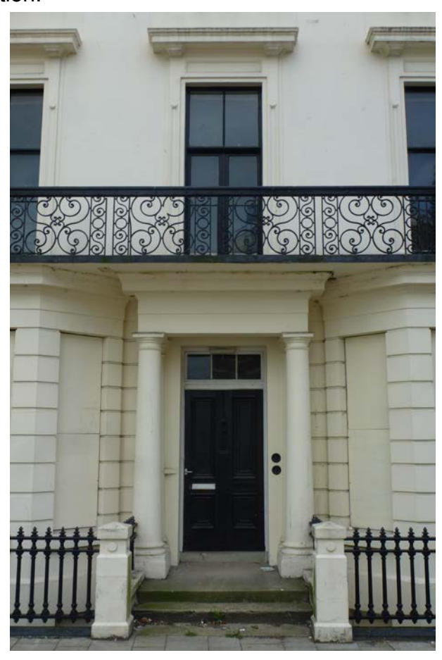
Entrance doorway to Cambridge Terrace

Although overall in general good condition, at the time of the survey the building was largely empty and boarded up. The rear, which is accessible via a secluded footpath, has suffered from some vandalism with window glass being broken and is generally in a rundown condition.