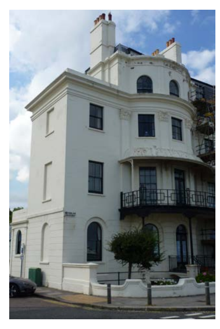
Corner house to Waterloo Mansions

The hierarchy is continued with Corinthian columns from first to second floor to the end and centre houses in the middle range supporting an entablature and plain pilasters at third floor level. The curved fronts of the end houses of each section form bookends to the ranges. The outer blocks of Waterloo Mansions are of four and five storey in height, with basements, and help to emphasise the strong horizontal rhythm of the Crescent. The rear is simpler in architectural detailing but retains the hierarchy of fenestration.