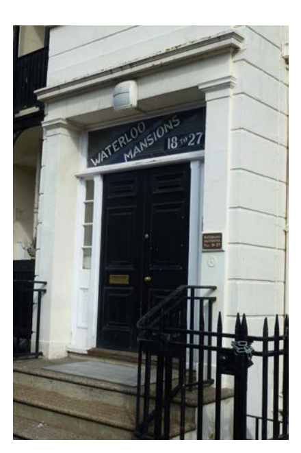
Entrance door to Waterloo Mansions

Above the stuccoed ground floor elevation the buildings are constructed of yellow brick. Protruding bays form the principle entrances to the individual properties, with doors surrounded by a plain pilaster, margin lights and the building name and number