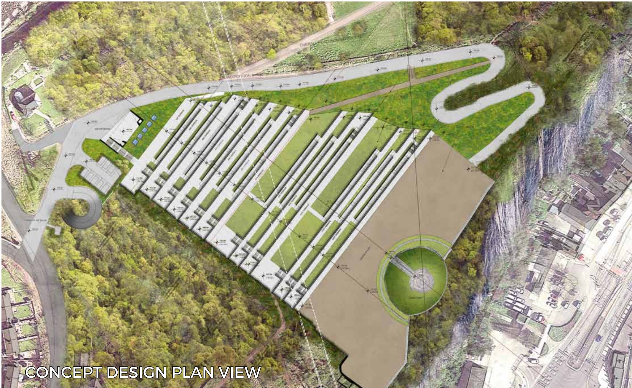
CONCEPT DESIGN PLAN VIEW