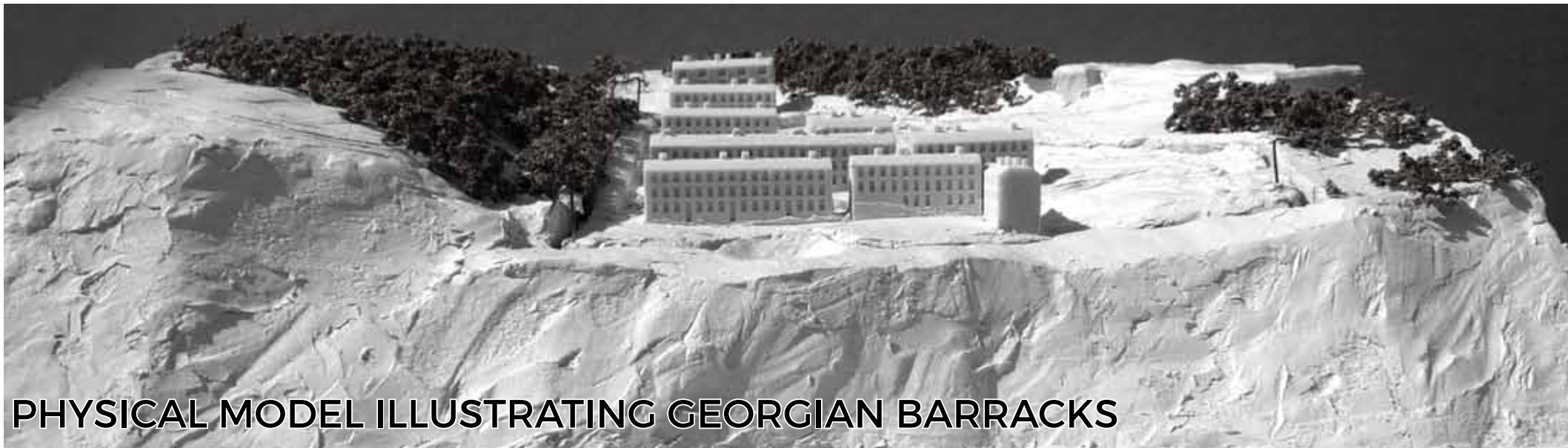
PHYSICAL MODEL ILLUSTRATING GEORGIAN BARRACKS