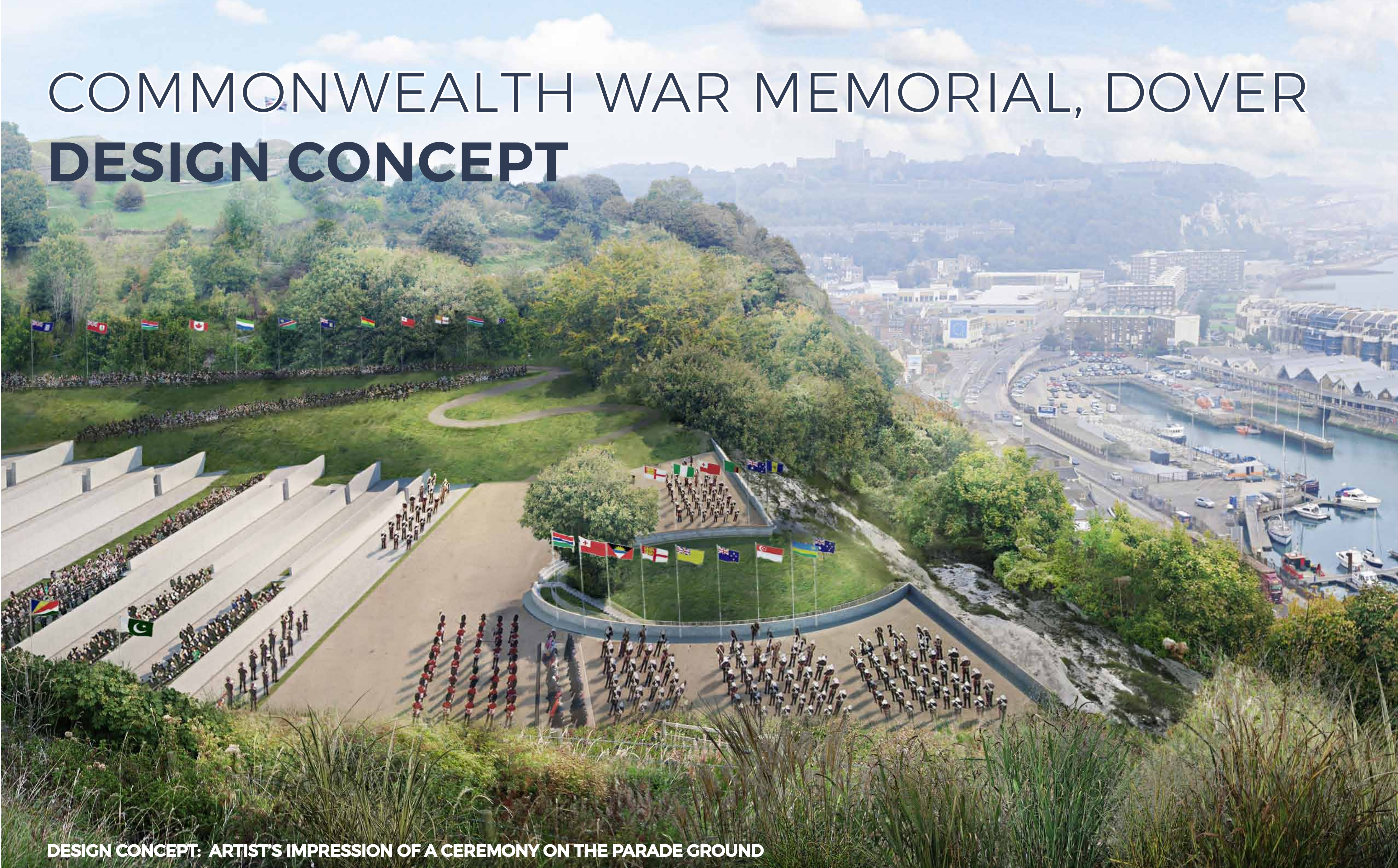
DESIGN CONCEPT: ARTIST'S IMPRESSION OF A CEREMONY ON THE PARADE GROUND