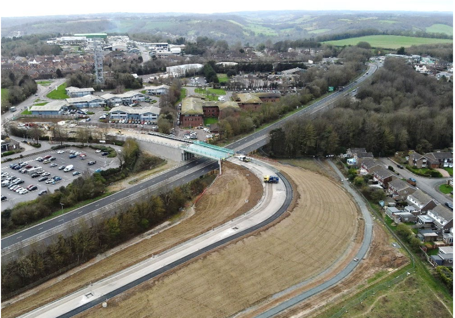
Image above shows Section 1b North (new bridge and embankment) and construction of asphalt.

This month in Section 1b North, we have installed street lighting along the new section of road. We have also made progress constructing the footpaths along the embankment and the Public Right of Way. In Section 1b South, we have started to construct the road connecting the bridge to Tesco roundabout. This has involved laying the subbase that will lie under the asphalt and laying the kerbs.