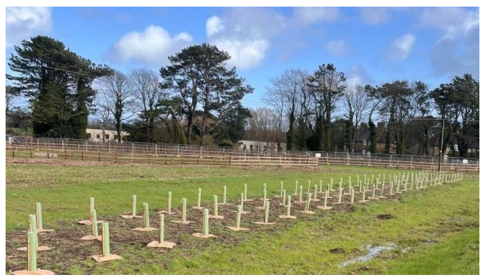
Image shows a section of the planting being carried out in Section 2

Over the coming weeks, we aim to demobilise our compound and prepare to lay the final surface course on the new road. We will also be carrying out final snagging works throughout the Section.