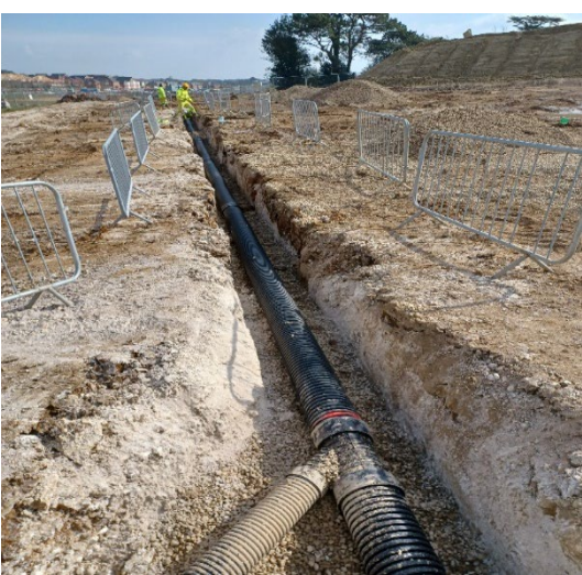
Installation of Drainage Pipes