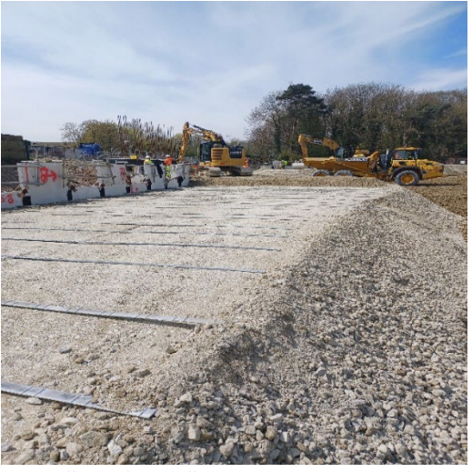
Wall panels installation in Section 1B North

We have also continued installing drainage systems in to Section 1b North. These will be used to move surface water, which will be funnelled into new and existing drainage systems.