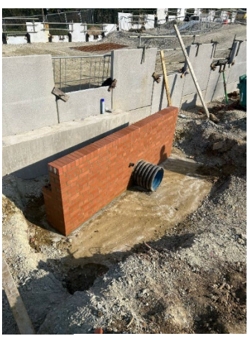
Completed brick headwall

We will continue the fill of the embankment in Section 1b North and install concrete columns in Section 1b North for the bridge. In Section 1a, we will commence construction of drainage through the new road, including soakaway tanks and ponds.