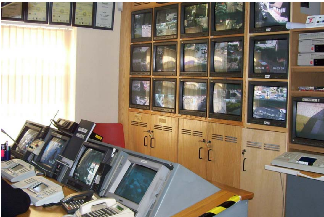
Dover CCTV Control Room