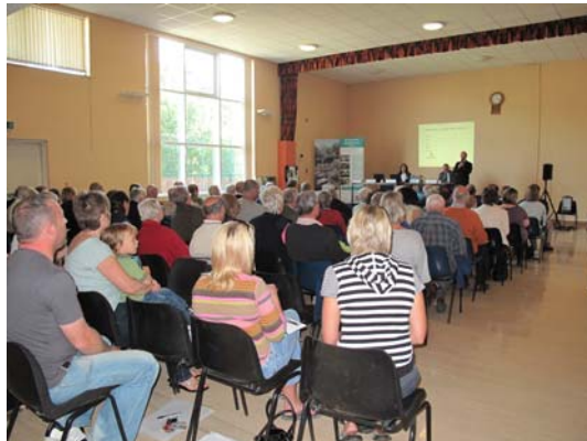
Above. Dover North 'You decide' event