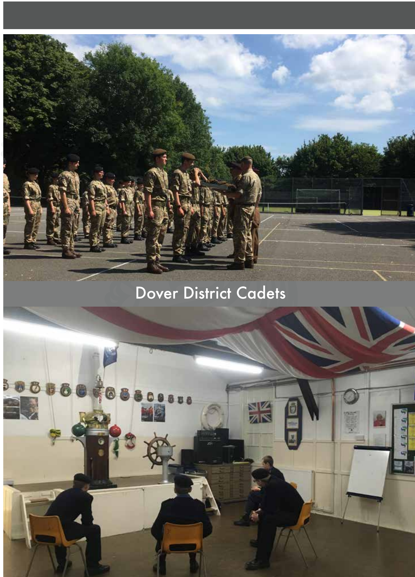
Dover District Cadets