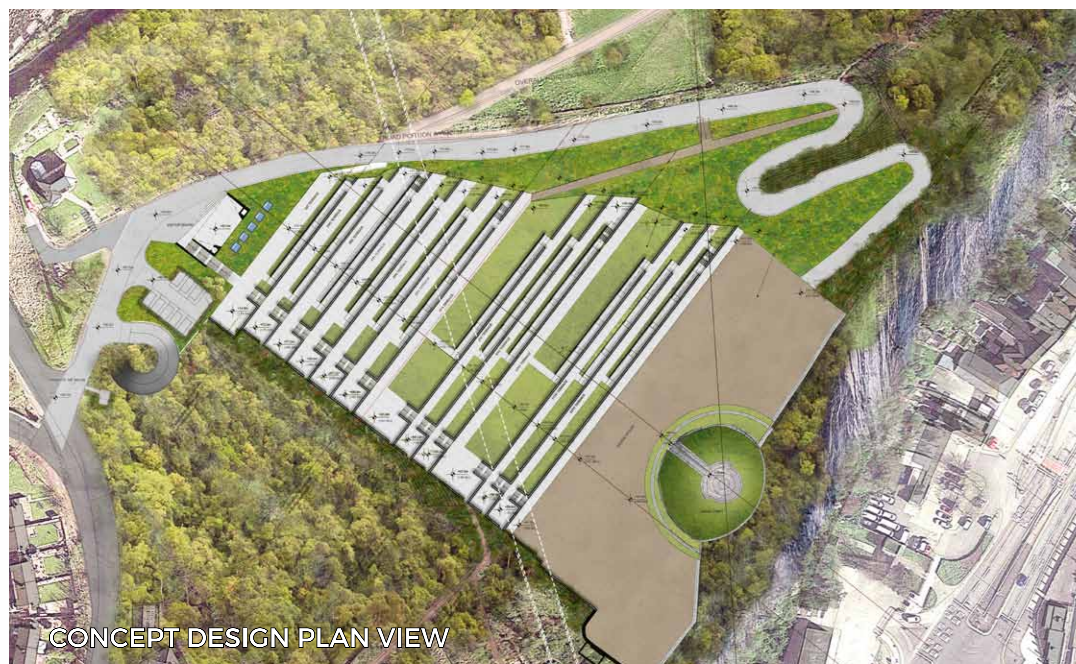
CONCEPT DESIGN PLAN VIEW