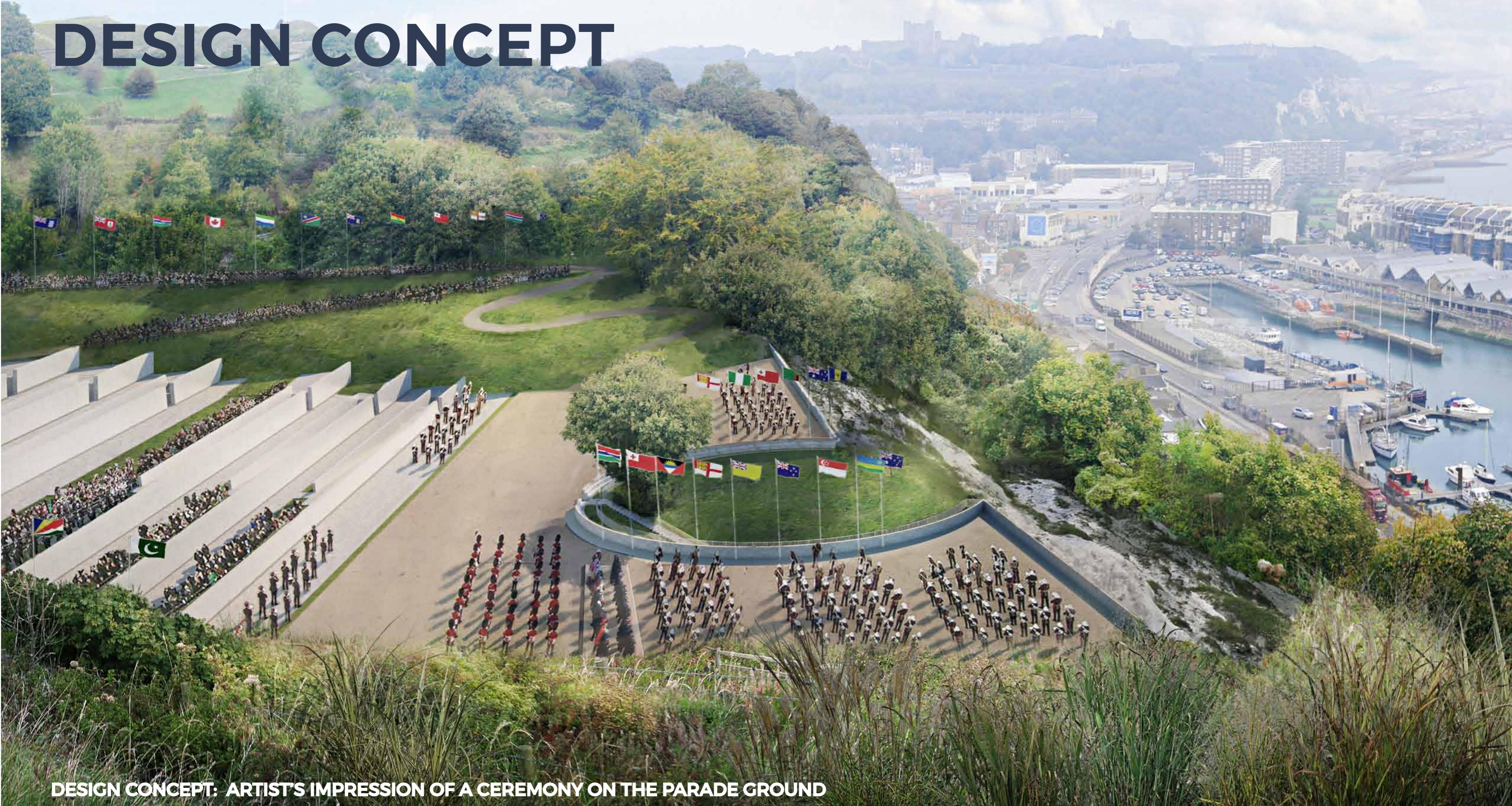
DESIGN CONCEPT: ARTIST'S IMPRESSION OF A CEREMONY ON THE PARADE GROUND