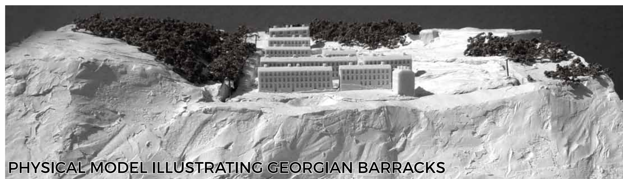
PHYSICAL MODEL ILLUSTRATING GEORGIAN BARRACKS