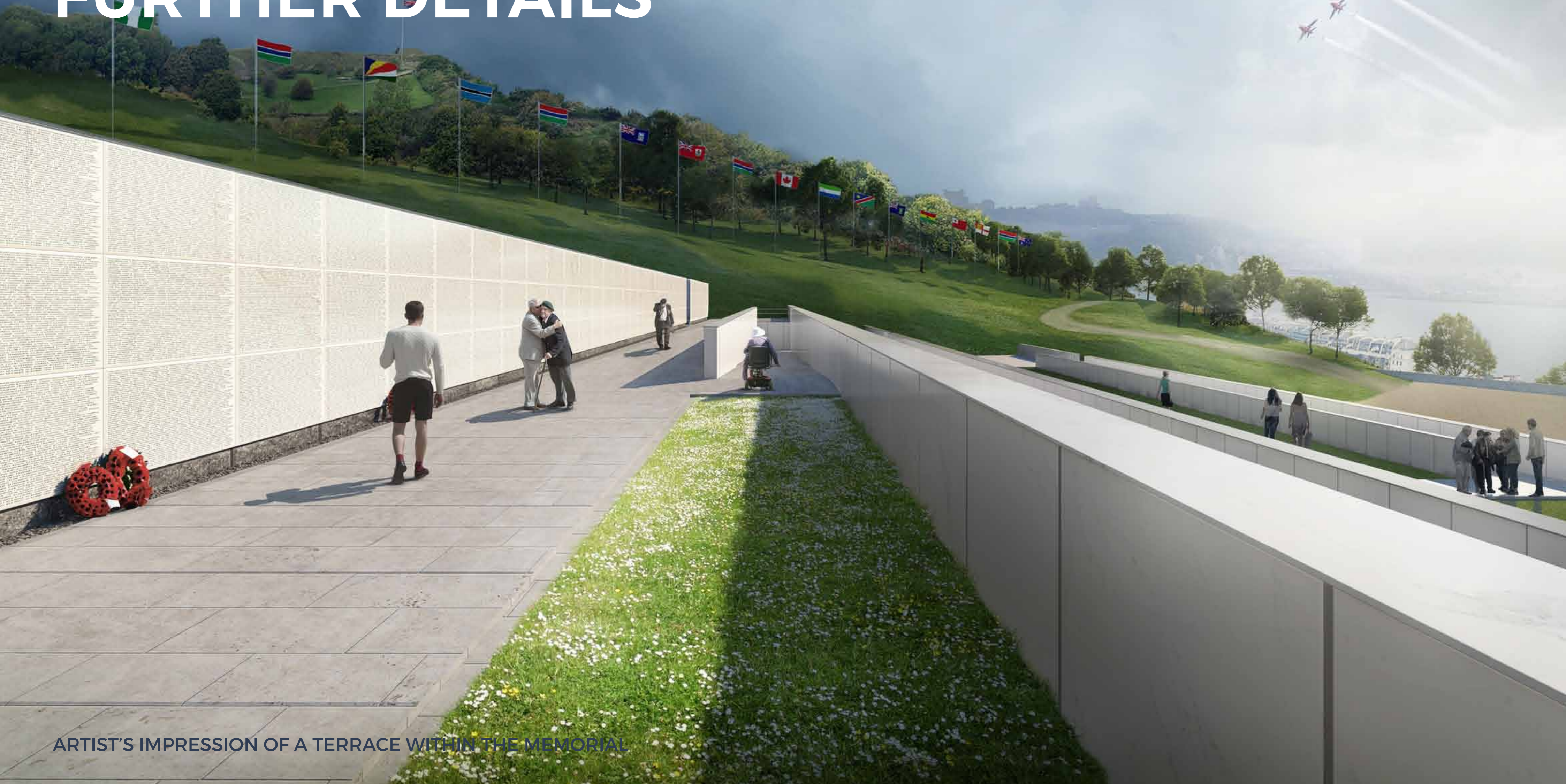
ARTIST'S IMPRESSION OF A TERRACE WITHIN THE MEMORIAL