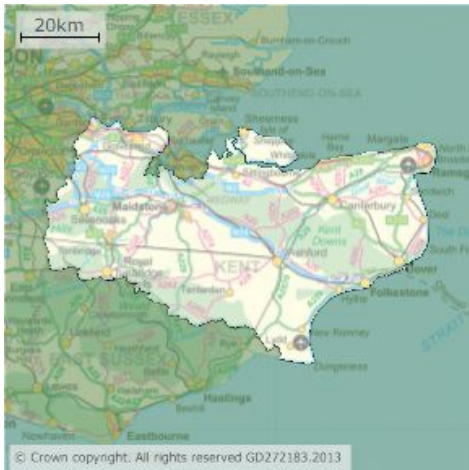
Map of Kent