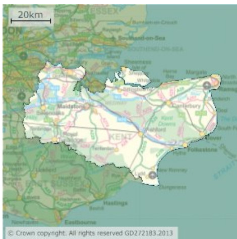
Map of Kent