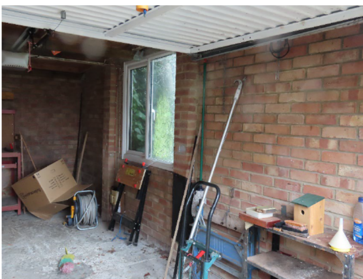
Plate 3. General view of the internal area of the garage.