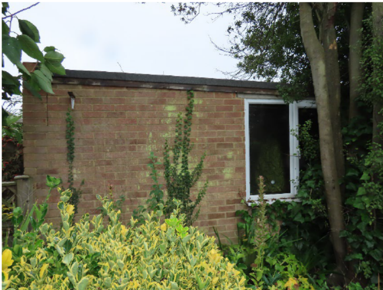
Plate 2. General view of the side of the garage.