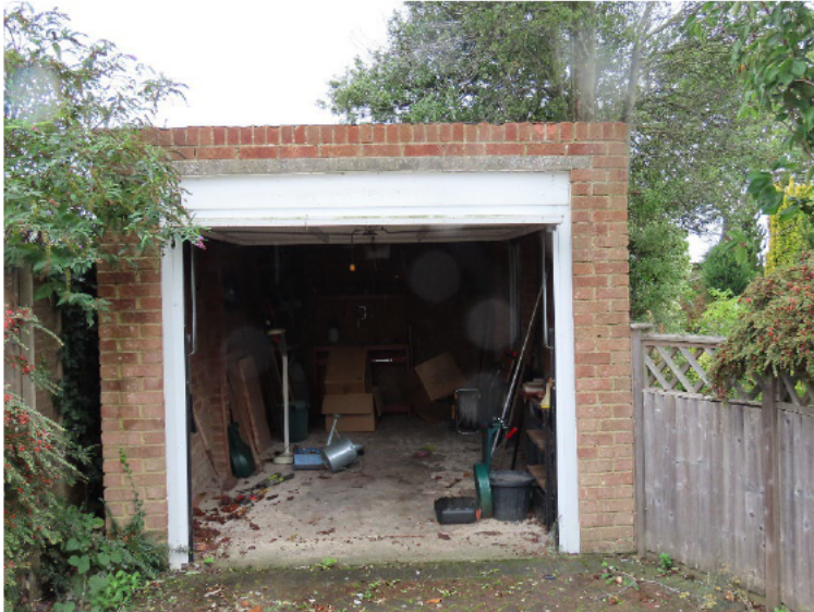
Plate 1. General view of the front of the garage.