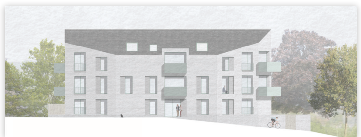
Military Road, Dover

This site plans to provide 8 homes consisting of 6 x 1 bed flats 2 x 2 bed flats, one of which will be wheelchair accessible. The new homes will be let at social rent. Construction is due to commence on site in 2025. Homes England grant funding has been awarded for this site.