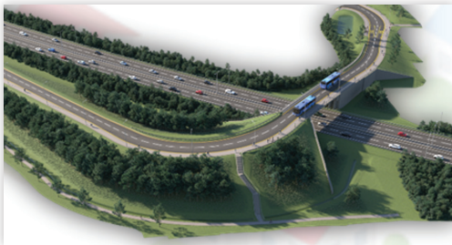
Figure 1 - Fastrack CGI Express Route Bridge Over the A2

Dover Fastrack is now open and will be an all-electric rapid bus transit system connecting Whitfield with Dover town centre and Dover Priory railway station. Dover Fastrack supports the sustainable development of new housing in Whitfield and at the former Connaught Barracks site, along with commercial development on the White Cliffs Business Park in Whitfield.