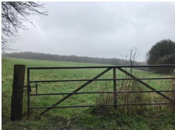
view of the access to the site off Belsey Lane