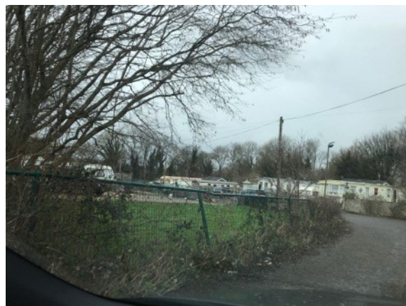
view west to east of the existing site