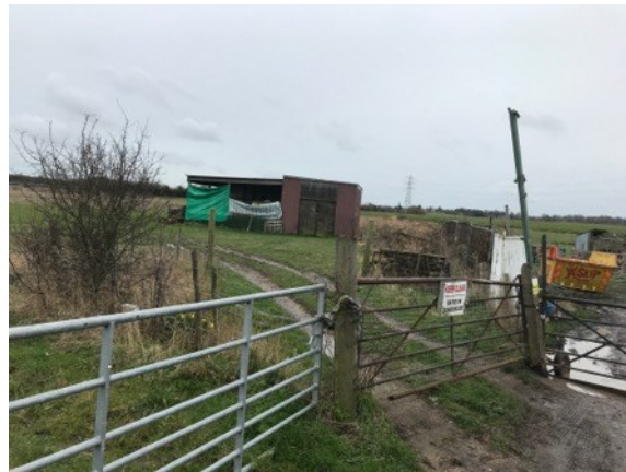
site access shared with adjoining landowner