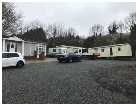
north east view of existing static homes