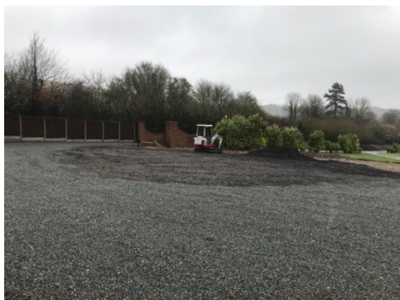
south-east towards site entrance