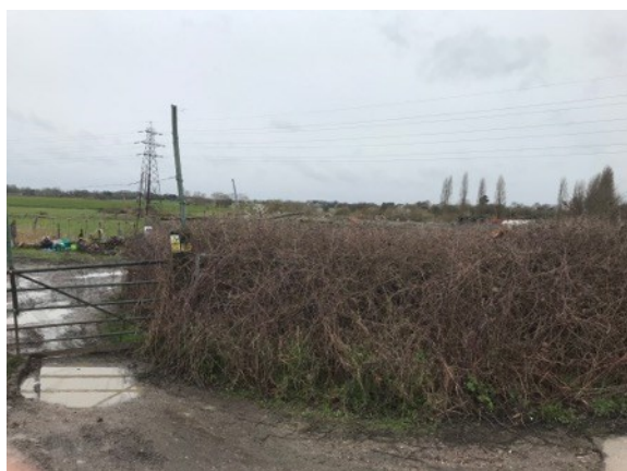
access from Ash Road