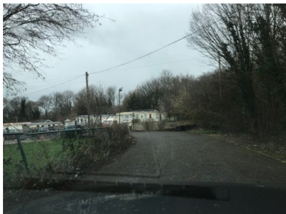
entrance to the existing caravan site