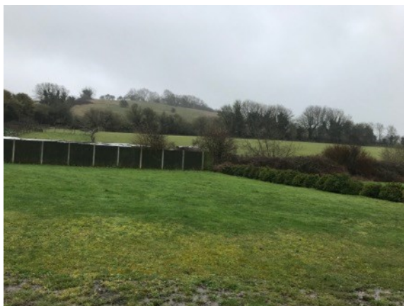
south-east view of the amenity provision