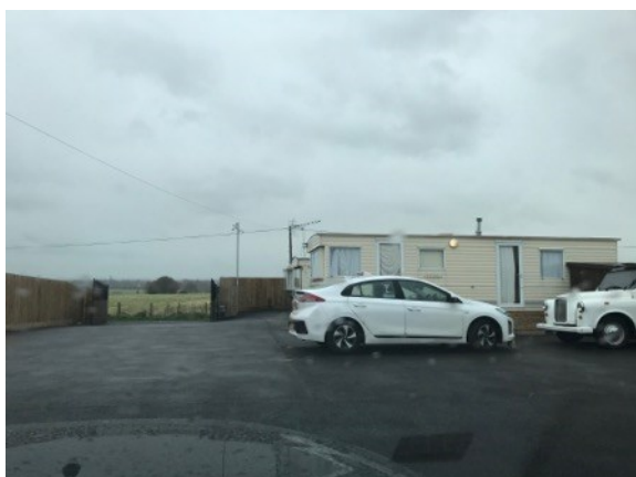
Existing static homes on plot 3 (Strawberry Place) as well as vacant pitches on the same plot