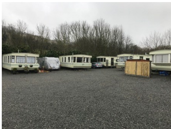
north-west view of static homes