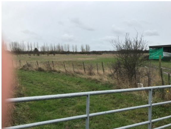
entrance to the site looking northwards