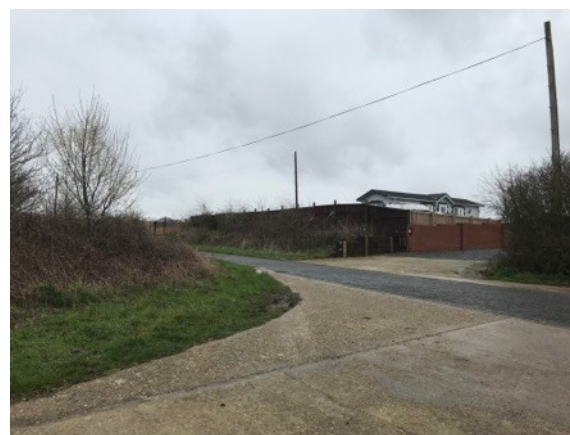
entrance to plot 1