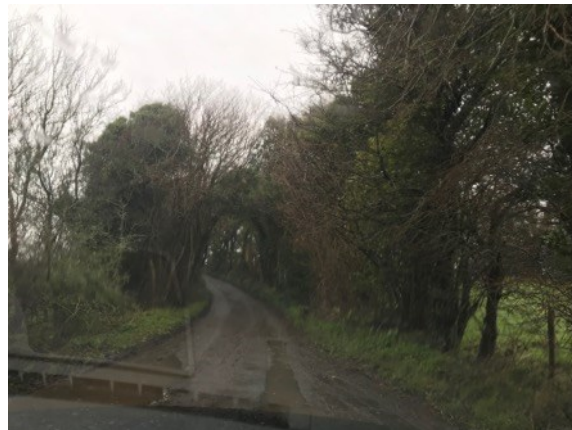
Site to the east off Belsey lane