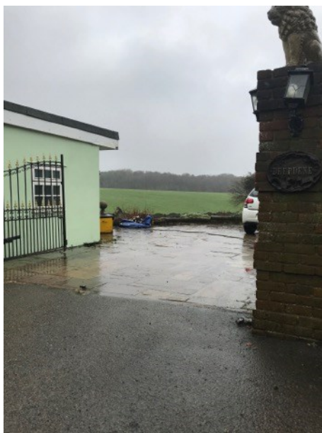
existing entrance to Romany Caravan