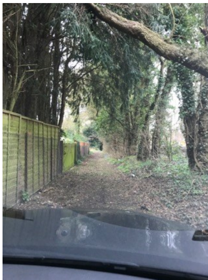
west to east view of the path of the southern boundary with the caravan site