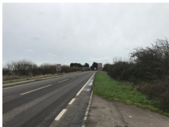
looking south on Ash Road from site access