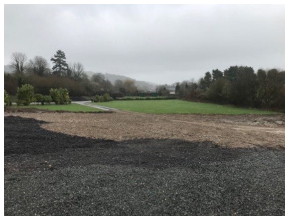
south-east towards Alkham village