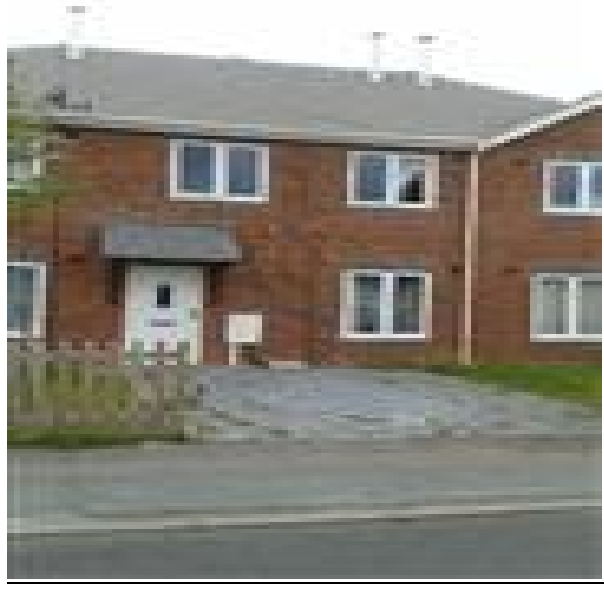
Affordable housing at Adelaide Road, Elvington

Which benefited from S106 funding from developments at 59 The Marina, Deal 12/00455 and Land rear of Old Park Close, Dover 12/00045