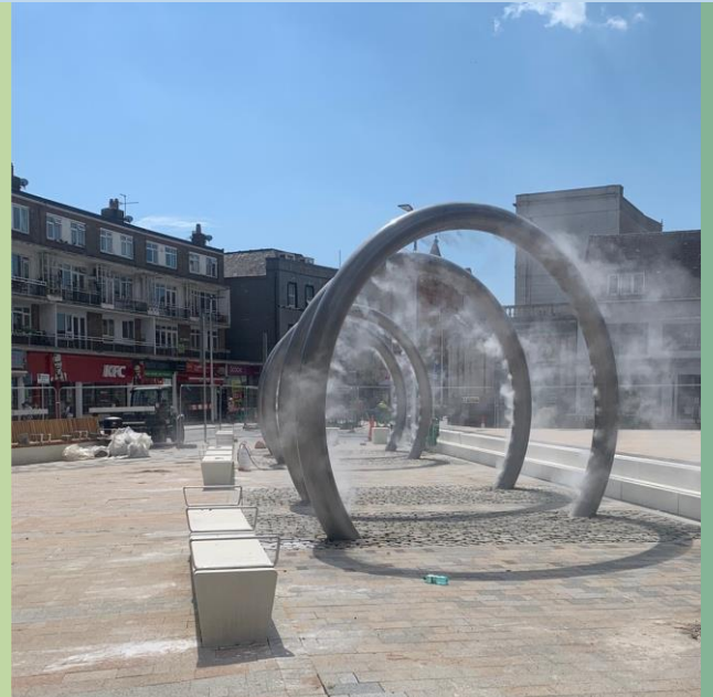
The arches which form the misting feature within the market square have been up and running.