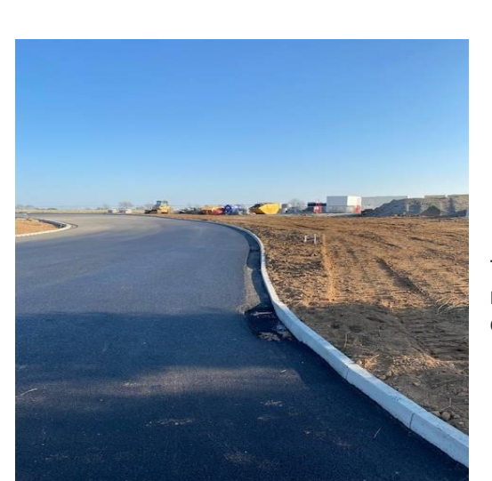
The first 120m of completed carriageway

The Colas site compound is constructed in Section 1B South, adjacent to the Tesco roundabout. The site compound building will be in place until Summer/Autumn 2023. Groundwork continues in this section which includes surveys and drainage, progressing towards creating an entrance to 1B North.