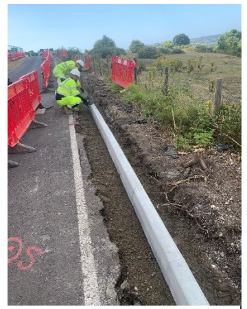
Section 3 kerb and drainage works on northbound verge near Guston Primary School.

Section 3 (Phase 1) commenced on 25/07/22 and a key milestone was quickly achieved by diverting a live medium pressure gas main outside the area of the new bus layby at Burgoyne Heights. This has enabled the construction of the new bus layby to commence.