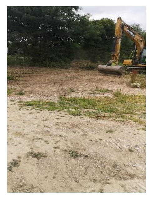
Section 1b Ground preparation

Trial holes along the verge on the A2 are taking place to ascertain the depth and position of the existing services to help in the construction of the bridge abutment.