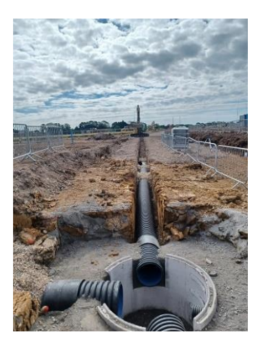
Section 2b drainage installation

Further drainage basins and soakaways which will provide attenuation areas and outfalls to the underlying chalk for the drainage system have also been constructed adjacent to the new road. Colas continue to work closely with the local farmer to ensure livestock are protected during the construction works.