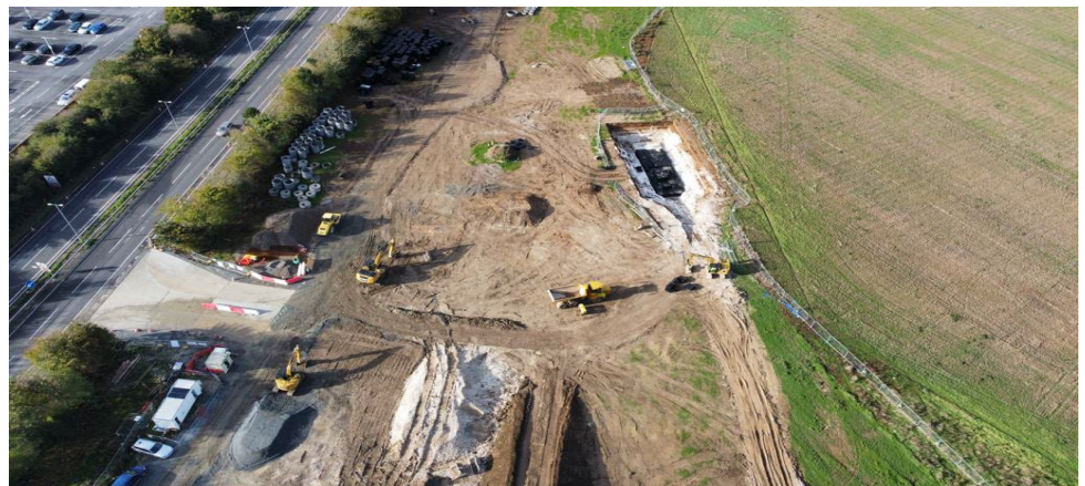
Aerial view of the new entrance and excavation of the soakaway tanks

Since our last newsletter we have started the installation of the soakaway tanks. The soakaway tanks allow for the surface water from the road to slowly soak into the natural chalk.