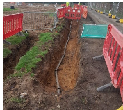
Exposing live services at the end of Section b adjacent to Dover Road

The drilling for the deep bore soakaways to allow surface water to discharge into the underlying chalk has been completed and associated drainage installation works are progressing well. We have also commenced the installation of street lighting columns.