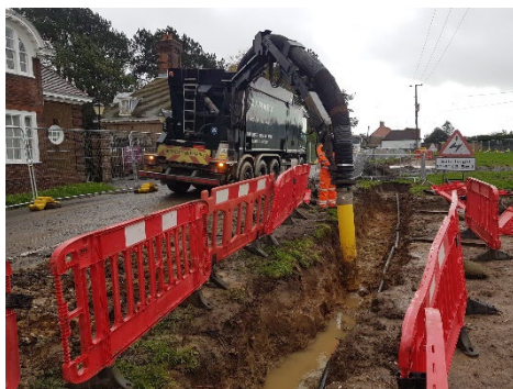
Vacuum Excavator on Dover Road

The ongoing road closure on Dover Road has enabled us to commence our works at the junction of Dover Road tie in. Our first task was to expose the live utility services using vacuum excavators and we will then lower those services that sit within our required excavation of the road.